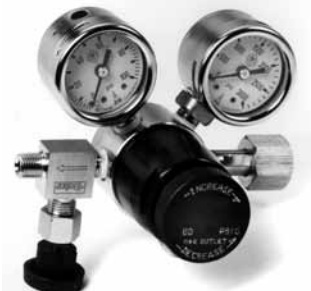
Series 3910 single stage brass lecture bottle regulator